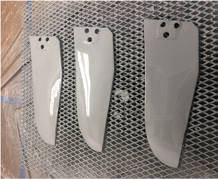
3. Mixing blades coated with Novocoat SC3300 Novolac Epoxy Lining.

When industrial settings demand quick repair solutions of key assets, ErgonArmor delivers with its Novocoat™ line of repair products that saves both time and money.