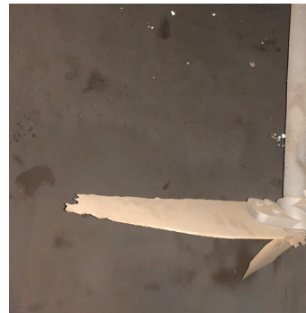
1. Interior of asphalt emulsion tank showing holes from corrosion. Corroded metal mixing blades showing deep pits and missing edges.

Novocoat EP3300 Paste/Caulk was selected to restore the mixing blades and repair damage to the steel structure of the