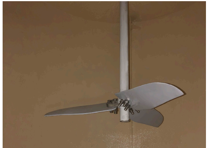
4. Finished interior of mixing tank with restored mixing blades.